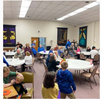
Tailgate for Missions Event