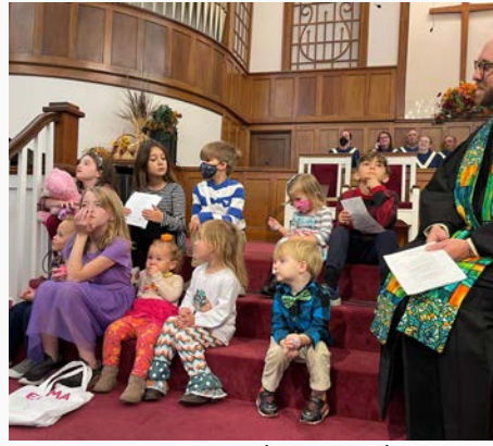
Learning about God