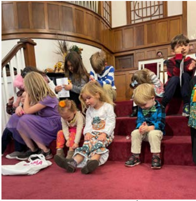
Praying in worship