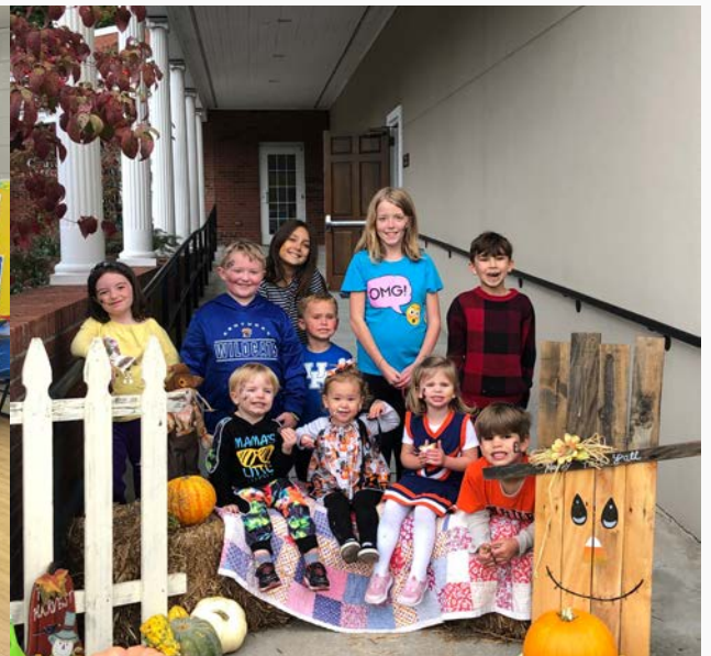
Fun and Games at the Tailgate for Missions

I believe it's a very Baptist idea--in line with the Baptist notion that you printed on your orders of worship and stationary for many years: "Every member a minister."