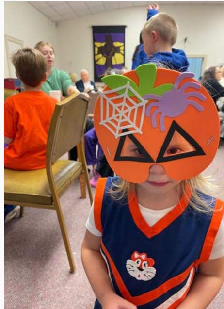
Tailgate for Missions Fun and Games