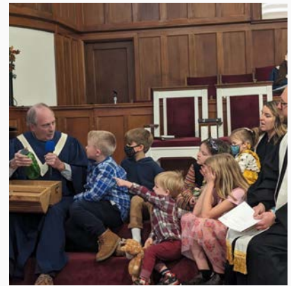
Children's sermon snapshot