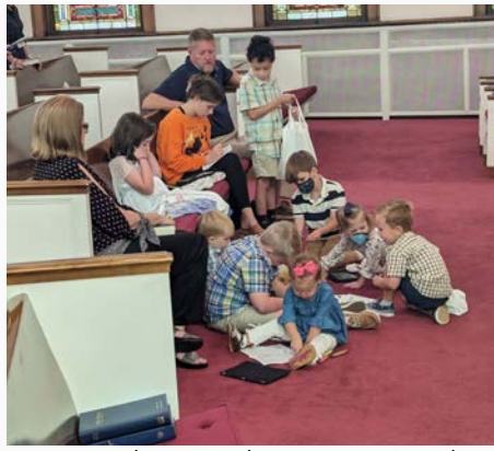
Our very busy and creative Worship!