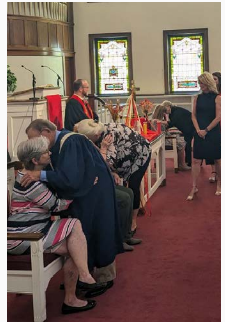
Deacon Ordination Sunday